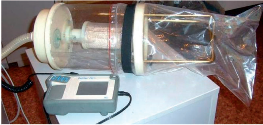
Figure 5 A laboratory image representing the Rebreather Hypoxytron® (Ukraine) device, which is capable of buffer reservoir volume regulation for individual hypoxia dosage. (A color version of this figure is available in the online journal.)

rest (by 5.8%) and during mild exercise (by 18.8%). The antihypertensive effects persisted for two months. Another study from this group was conducted in 45 elderly patients with stable angina and I and II functional classes. 29 They used a “Hypoxytron” device as shown in Figure 5. Each IHT session consisted of four cycles of 5 min hypoxic mixture breathing (12–14% oxygen) alternated with 5 min air breathing. The IHT by “Hypoxytron” device was well tolerable and safe for vast majority of healthy elderly control subjects and elderly patients with ischemic heart disease. IHT led to the reduction in clinical symptoms of angina and of daily myocardial ischemia duration, normalization of lipid metabolism, and increased exercise tolerance. IHT also had positive effects on hemodynamics, microvascular endothelial function, and work capacity in healthy senior men. 27