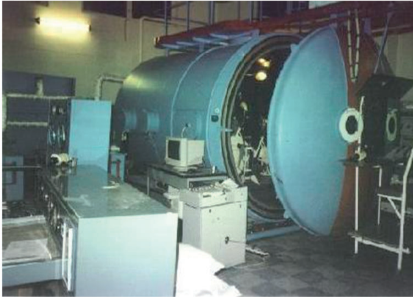
Figure 2 (a) The barochamber Ural-1 USSR (Orenburg Medical University, 1970–1990). (b) The training thermo-barochamber in Terskol, International Medico-Biological Scientific Centre, Russia-Ukraine (1970 to present). This large climatic test bench can reconstruct the atmospheric conditions equivalent to 9000 m altitude. (A color version of this figure is available in the online journal.)

diseases in humans may carry its own risks and a third of the patients subjected to hypobaric IHT in simulated altitude chambers had side effects such as headache, stenocardia, and cardiac rhythm disturbances. Furthermore, barochambers for human use are often expensive to build and demand personnel with necessary medical specialty skills, which may not be practical in many healthcare settings. To determine and control the appropriate hypoxia dosage for each individual patient in the settings of hypobaric chamber is also a great challenge. It was suggested that intermittent hypobaric hypoxia may produce harmful biochemical changes, including decreased antioxidant capacity and increased lipid peroxidation, which may lead to suppression of vascular endothelial function and impairment of vascular hemodynamics. 67