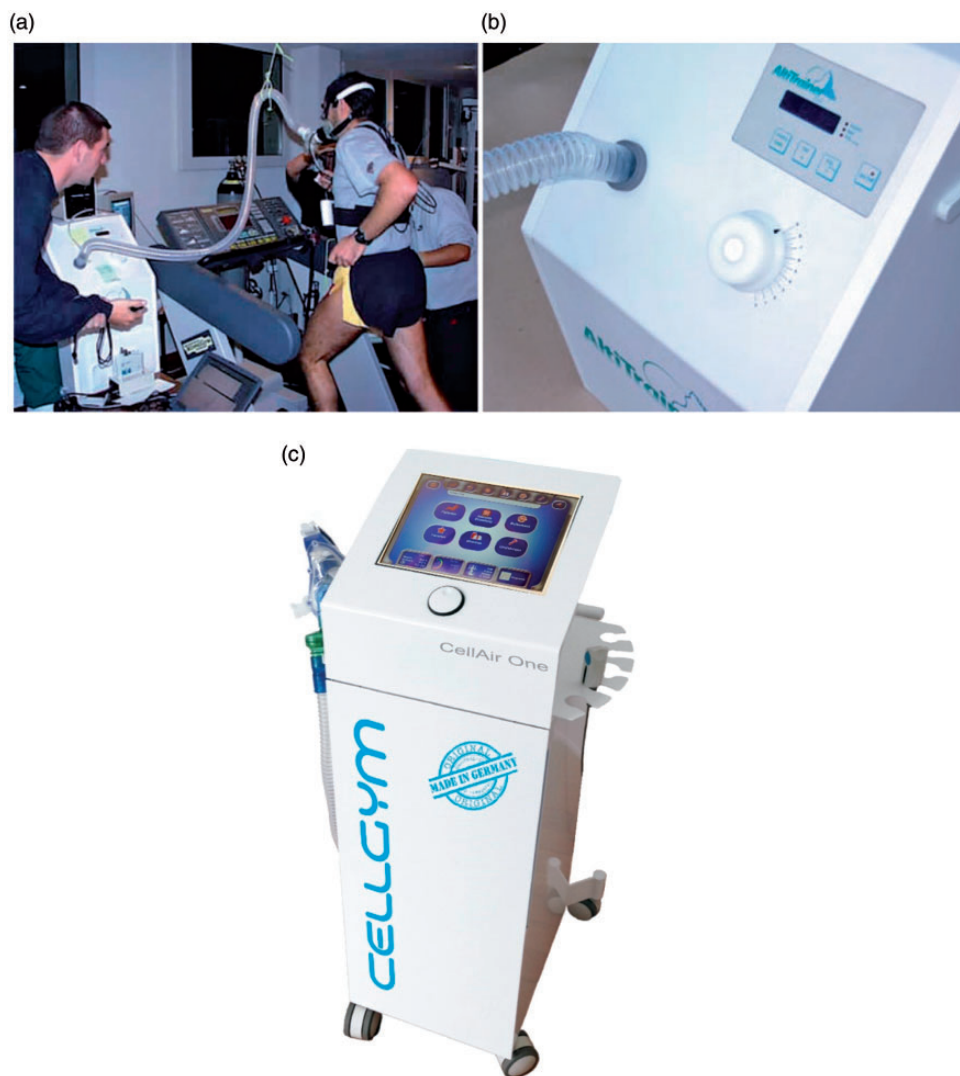
Figure 4 The commercial image representing: (a) and (b): AltiTrainer200® (Switzerland). The picture is adopted from: http://www.smtec.net/en/products/altitrainer . (c) CellAir One® (Germany), a device for hypoxic–hyperoxic training. The picture is adopted from: http://cellgym.de/products/iht-systems/?lang=en . (A color version of this figure is available in the online journal.)